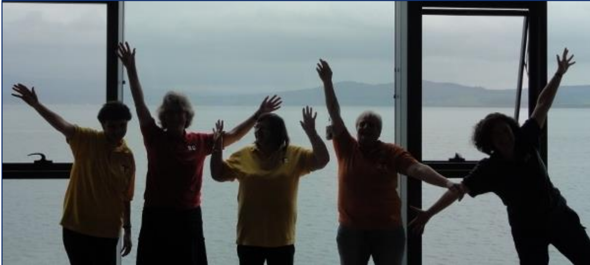
It could almost be a Girls Aloud album cover. Well, almost.

Before we go- When we go on our travels we sometimes have time to spare before we perform. This enables us to take more photographs. Some are often silly, such as a few of the ones below. But being silly can be good for the soul!